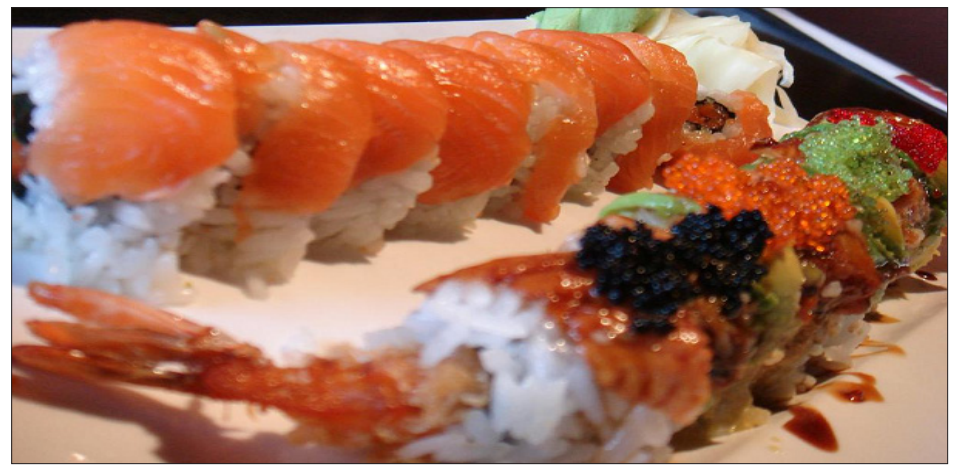
The Pink Lady and Honey Dragon Rolls

A spiky-haired waiter brought my rolls over, providing a description of