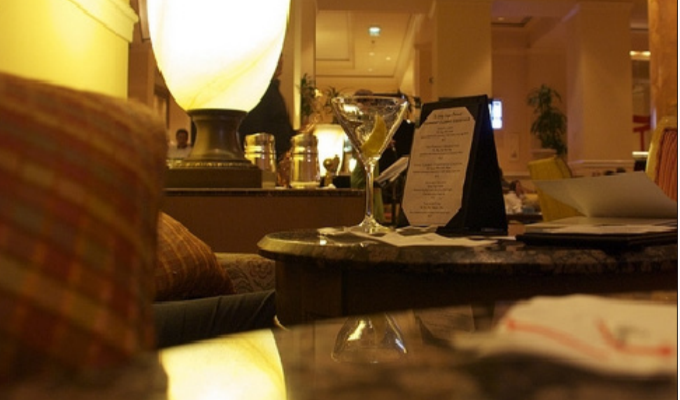
BY GREG WILLIAMS

The Lobby Lounge at the Fairmont Hotel 170 South Market Street, San Jose, California 95113 (408) 998-1900 http://www.fairmont.com/sanjose