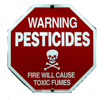
Art from Van Ness Avenue, San Francisco, CA, 15 August 2006

According to EPA estimates, about 5-8 million pounds of chlorpyrifos are used nationwide per year.