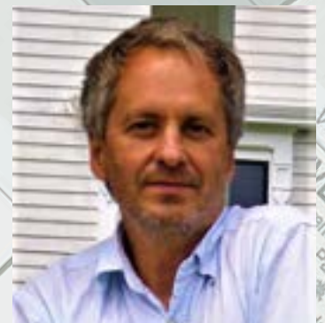
JONATHAN SIMON AUTHOR OF CODE RED: COMPUTERIZED ELECTIONS AND THE WAR ON AMERICAN DEMOCRACY