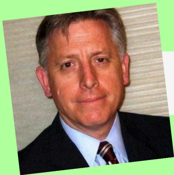
moderated by BRIT BENJAMIN '16