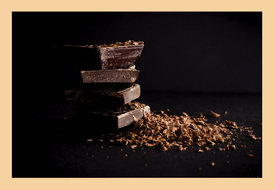
Thursdays from 12-1 in the Atrium