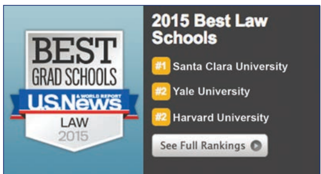
Number one again. Ho-hum, bore bore, nothing new to see here.

U.S. News was particularly impressed with the facility improvements at Santa Clara this year. The organization applauded recent strategic development decisions, such as prioritizing the new fountain on Palm Drive, additional landscaping in front of the historic Mission Church, and a parking structure, over improvements