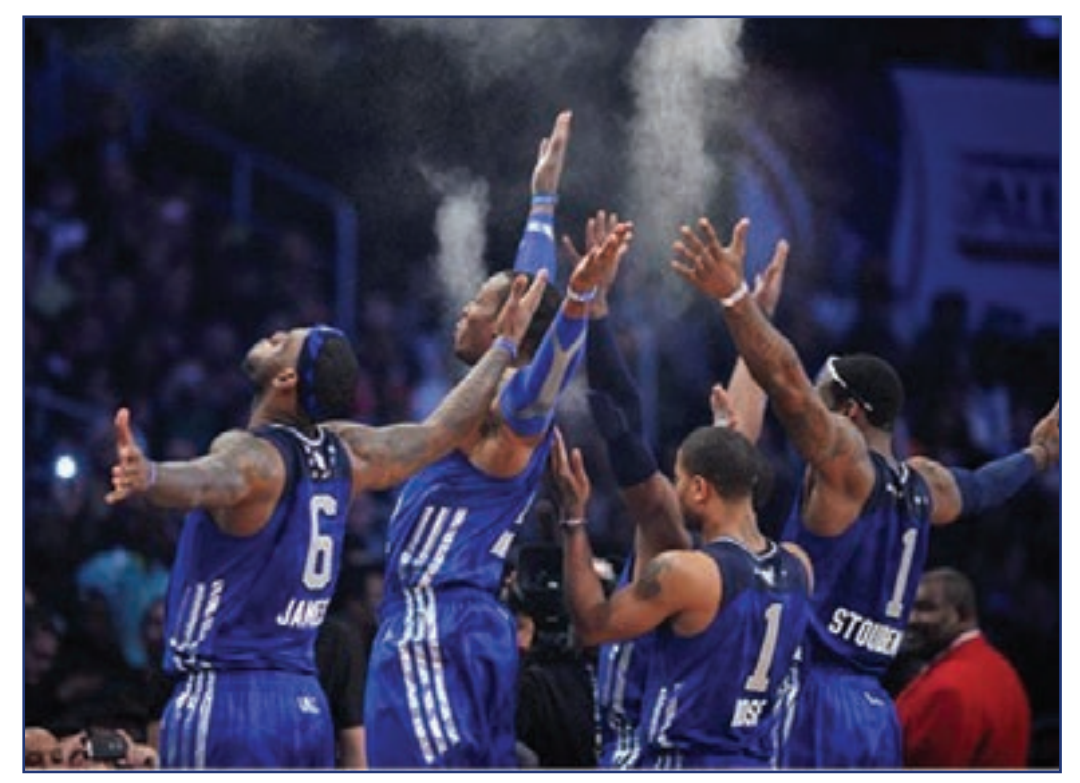
All-Star Games have become irrelevant exhibitions featuring all sizzle and no steak

antics amongst themselves on the sidelines than the game itself. Without a dedicated coaching system and meticulous practice, all-star players cannot even function as a true "team," especially in the modern sports era with ultra-calibrated offensive plays and highly complex defense strategies. It is no wonder that fans have begun ignoring all-star games in droves.