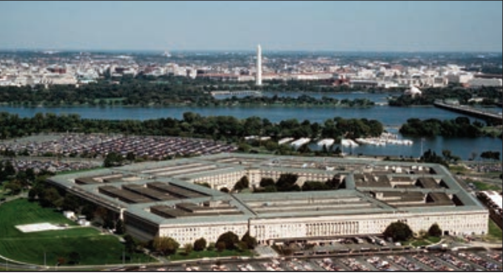
The recent government shutdown and sequestration has lead to a lack of job security within the intelligence community.

The way furloughs work is that each employee unofficially gets one of two designations: essential or nonessential. Essential employees don't get furloughed