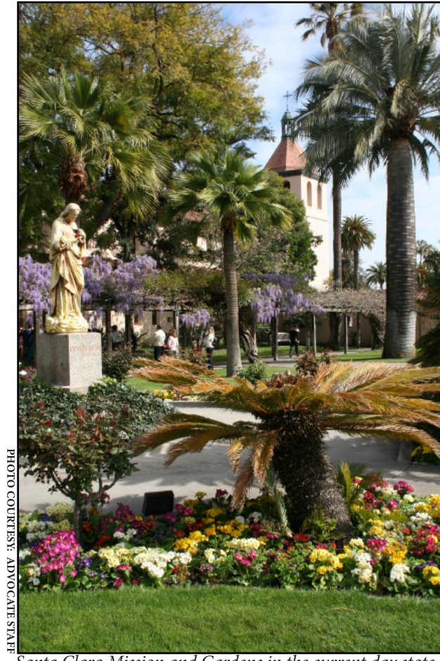
Santa Clara Mission and Gardens in the current day state.

their founding and for the missions to serve as a base for future economic development. This hope proved to be widely optimistic. The native California Indians were essentially a stone-age people, hunters and gatherers who had nothing which the Spanish valued