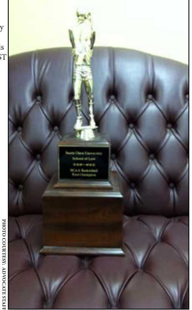
Winner's trophy of the faculty/staff pool. homemade fried chicken and waffles.

The important things are the prizes though. In my own house bracket, the winner will be dining