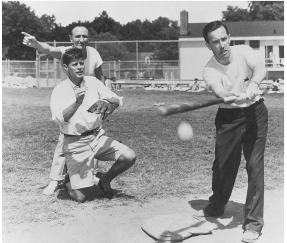
Senators Mike Mansfield (MT, umpire), John F. Kennedy (MA, catcher), and Henry "Scoop" Jackson (WA, batter) took time away from their senatorial duties for a relaxing game of baseball.

If you're anything like me, you've spent the weekend looking at the sunshine and really feeling summer calling. But, we've got one final push until we're skinning our knees and stirring lemonade. Or, one final push until we're working and taking night classes (or sitting in the library, studying for the bar.)