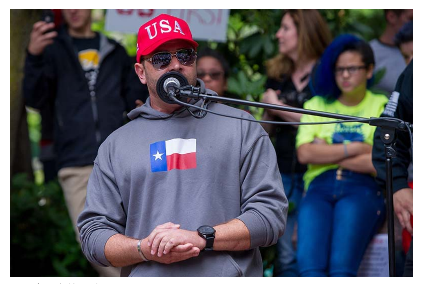
Kyle "Based Stickman" Chapman