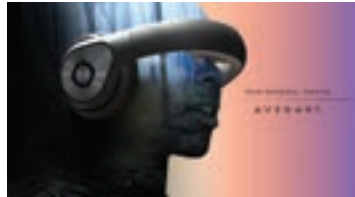
"Glyph" - World's First Personal Theatre! You may win two separate Glyphs.