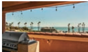
Romantic Getaway in Santa Cruz! Enjoy 2-nights and dinner. Donated by Montalvo Homes & Estates.