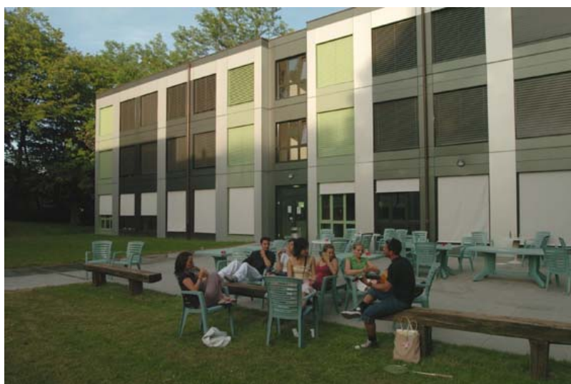
Here is a picture of the studio

This is where your classes will be held. This campus is located in the residential lakeside commune of Bellevue. Easily accessible by public transportation from the centre of Geneva, the train ride to campus is only 9 minutes. In Bellevue, students enjoy a pleasant stroll to two local ports - Saladin and Gitana. Residents of Bellevue have access to a public beach area that was recently developed. A boat ride in summer months plies back and forth to Geneva. Five restaurants are situated a short walk from campus. A pharmacy, grocery shops, a travel agency and a bank offering ATM and change facilities are located nearby for students' convenience.