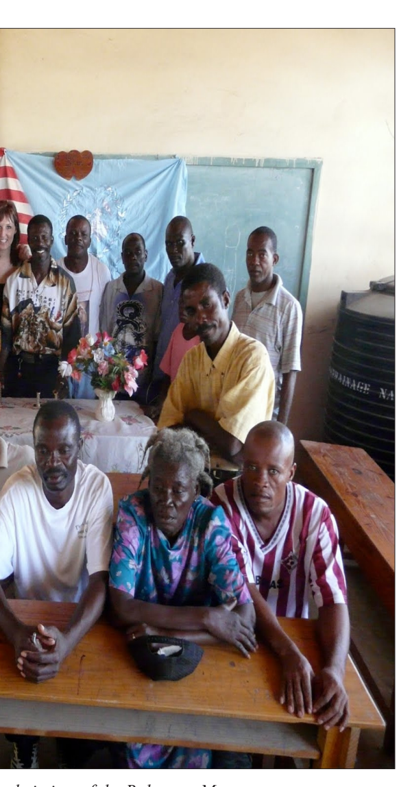
red victims of the Raboteau Massacre