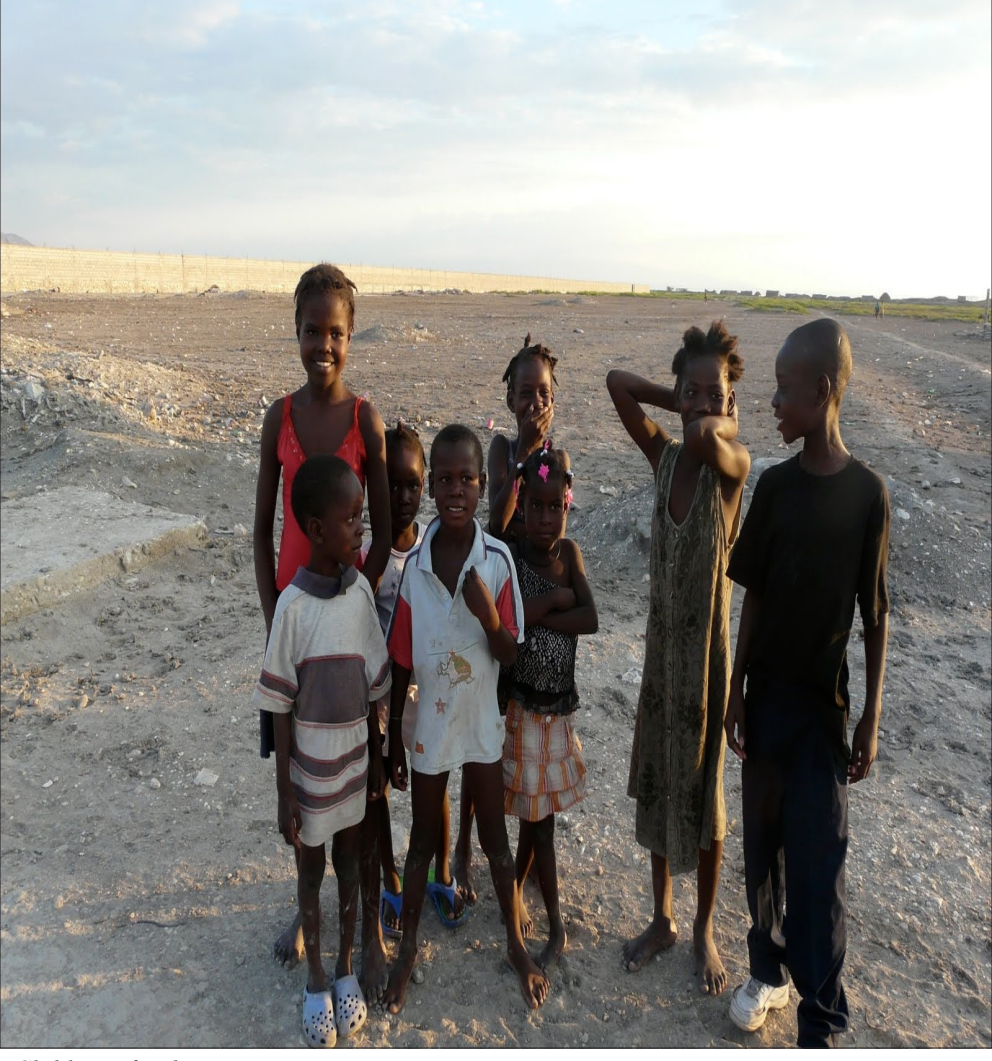
Children of Raboteau

I never really made a decision to go to Haiti, but if you ever do, a piece of you will never be able to leave.